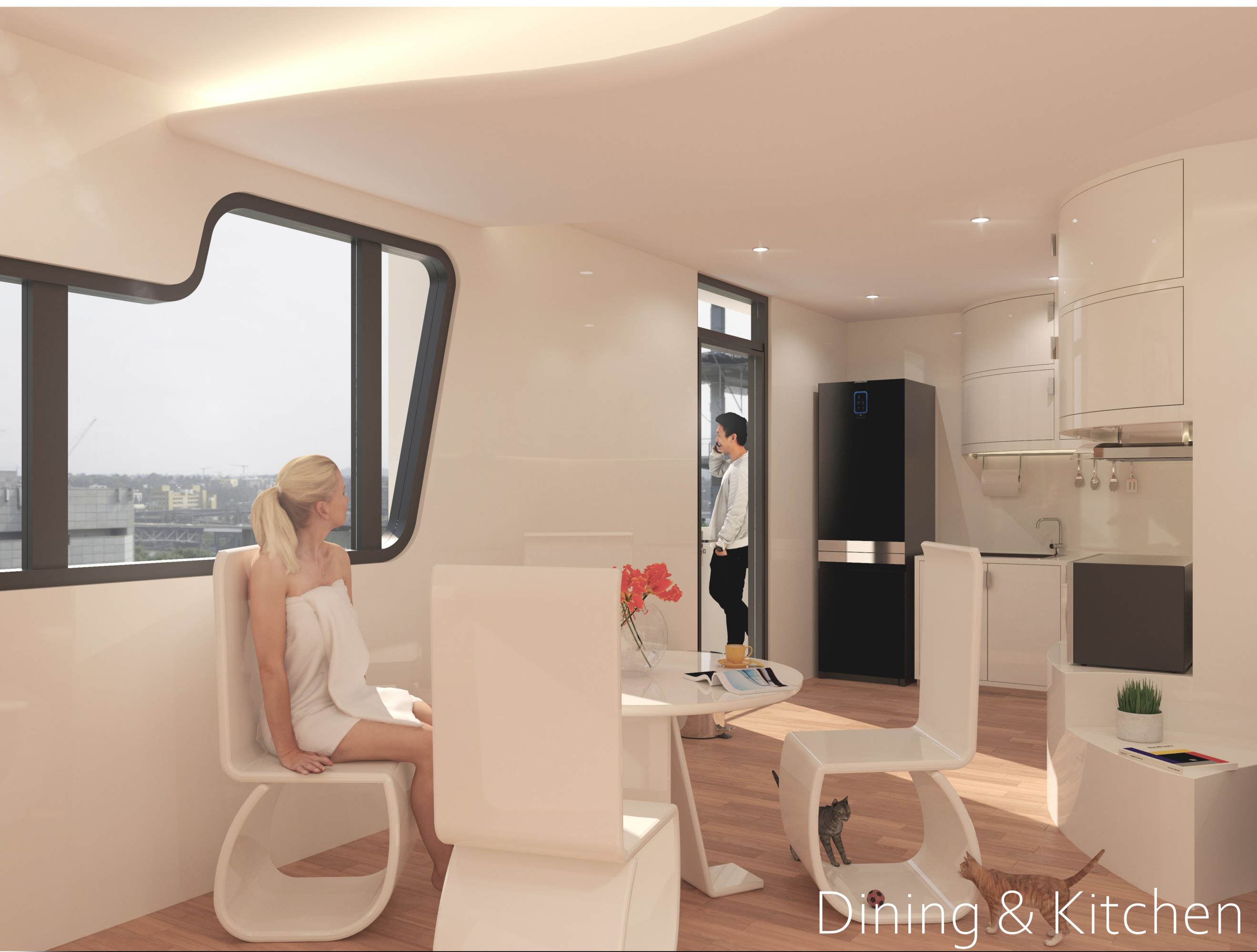
Dining & Kitchen

The bookshelves design with the ring-shape which is inspire by Hakka roundhouse, to increase flowing sense, while retaining functionality and provide secure sence while during reading.